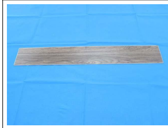
Test sample (back side)